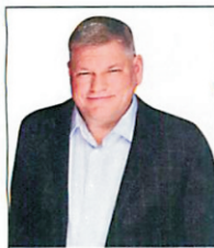
Randy Hoback Member of Parliament Prince Albert MPRandyHoback.ca

211 Centre Street, Box 2969 Nipawin, SK S0E 1E0 Tel.: 306-862-2203 Fax: 306-862-2267 randy.hoback.c2@parl.gc.ca