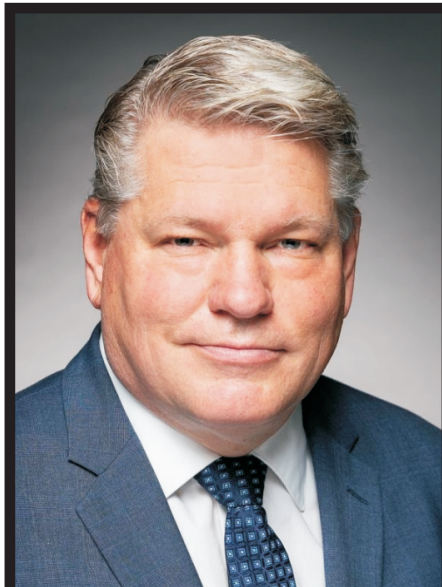
Randy Hoback MP Prince Albert