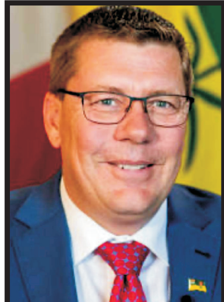
Hon. Scott Moe Premier of Saskatchewan