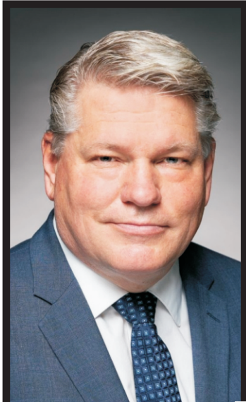
Randy C. Hoback MP, Prince Albert