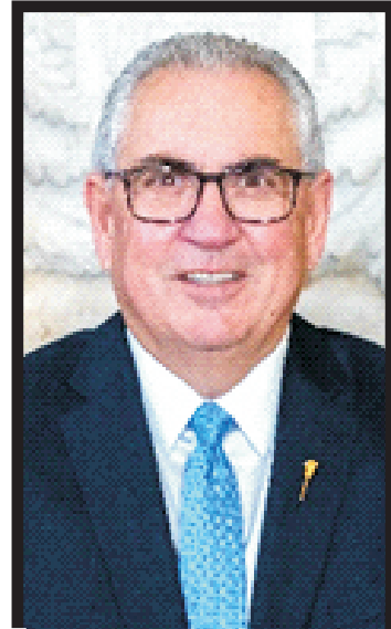
Joe Hargrave Minister SaskBuilds and Procurement