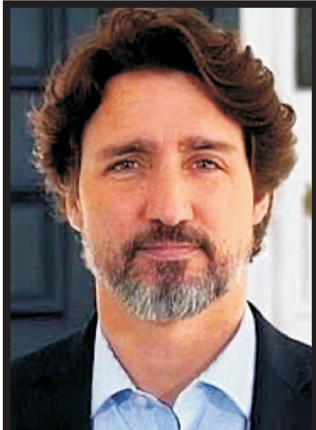
The Rt. Hon. Justin Trudeau Prime Minister of Canada